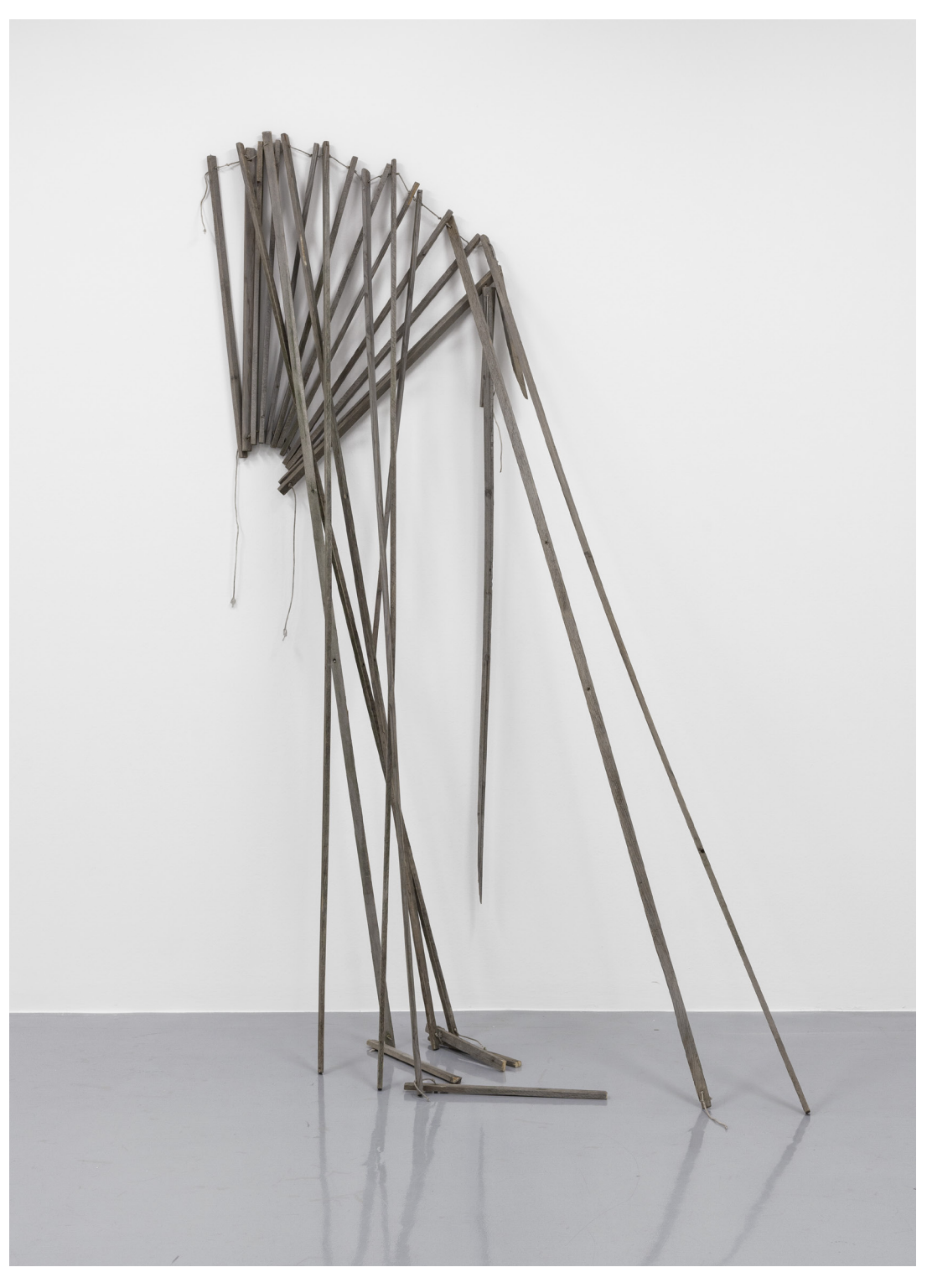
9, 10, 11, 12